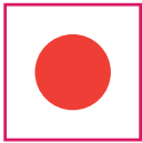
Made in Japan