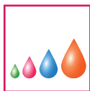
Piezo Variable Drop