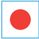
Made in Japan