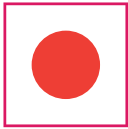
Made in Japan