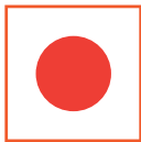
Made in Japan